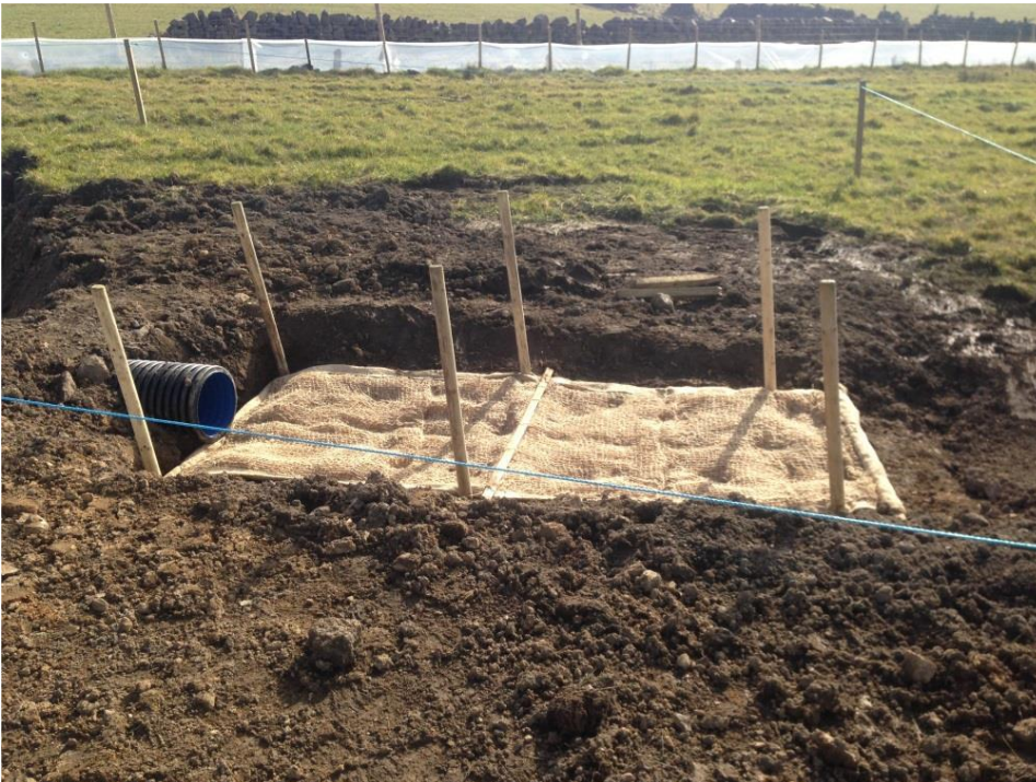
Plate 3: Typical silt mat to be placed at lagoon outfalls