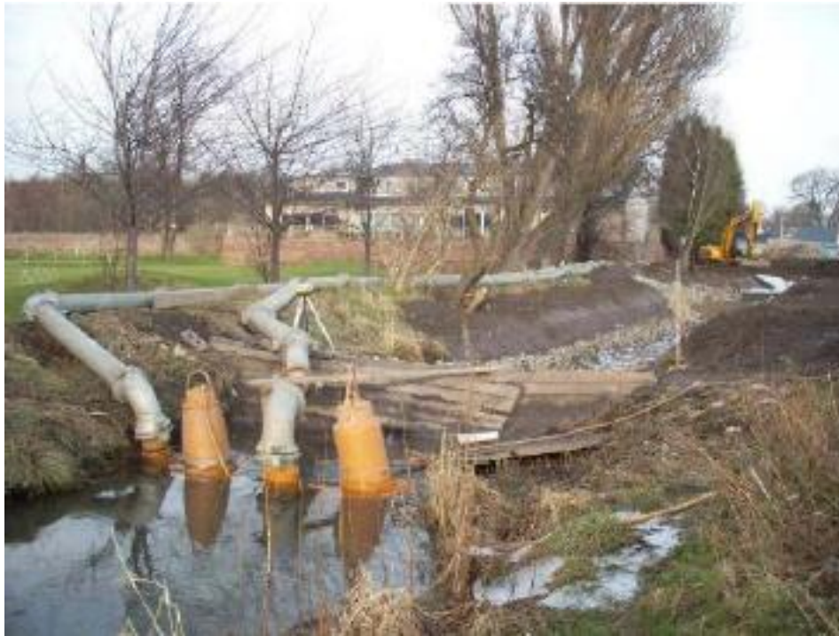
Plate 8: Full isolation - over pumping/siphon