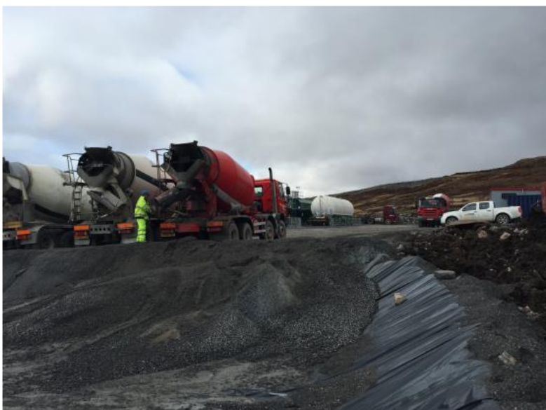
Plate 10: Typical concrete wash-out facility