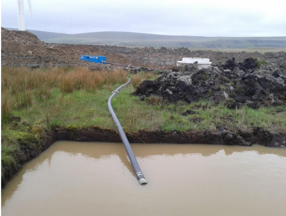
Plate 6: Typical 'Siltbuster' and settlement lagoon