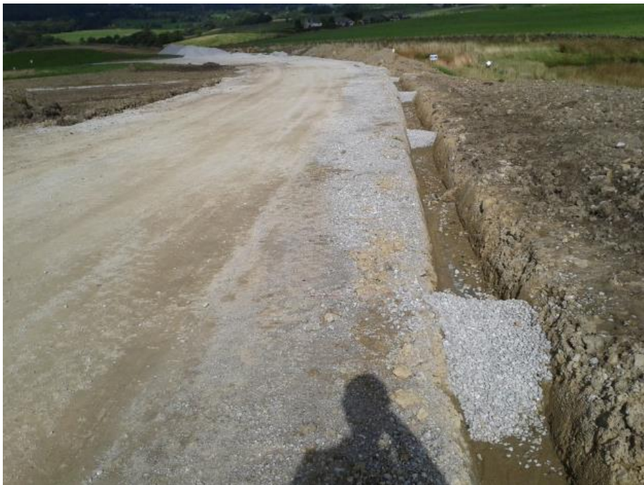
Plate 4: Typical check dams – to be installed in drainage ditches adjacent to roads