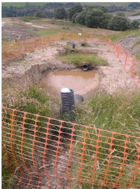
Plate 5: Typical lagoon and flocculent station