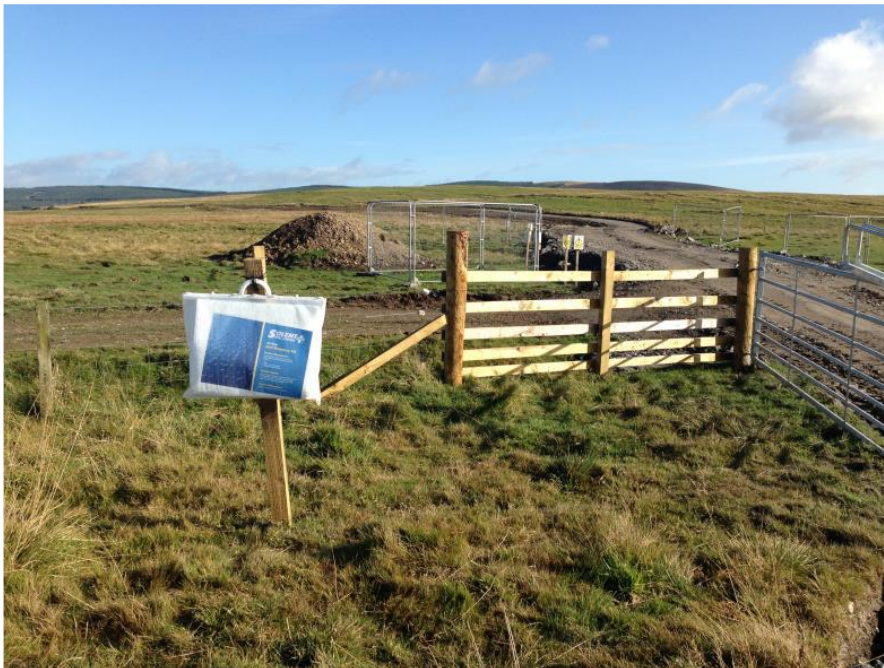
Plate 9: Spill Kits