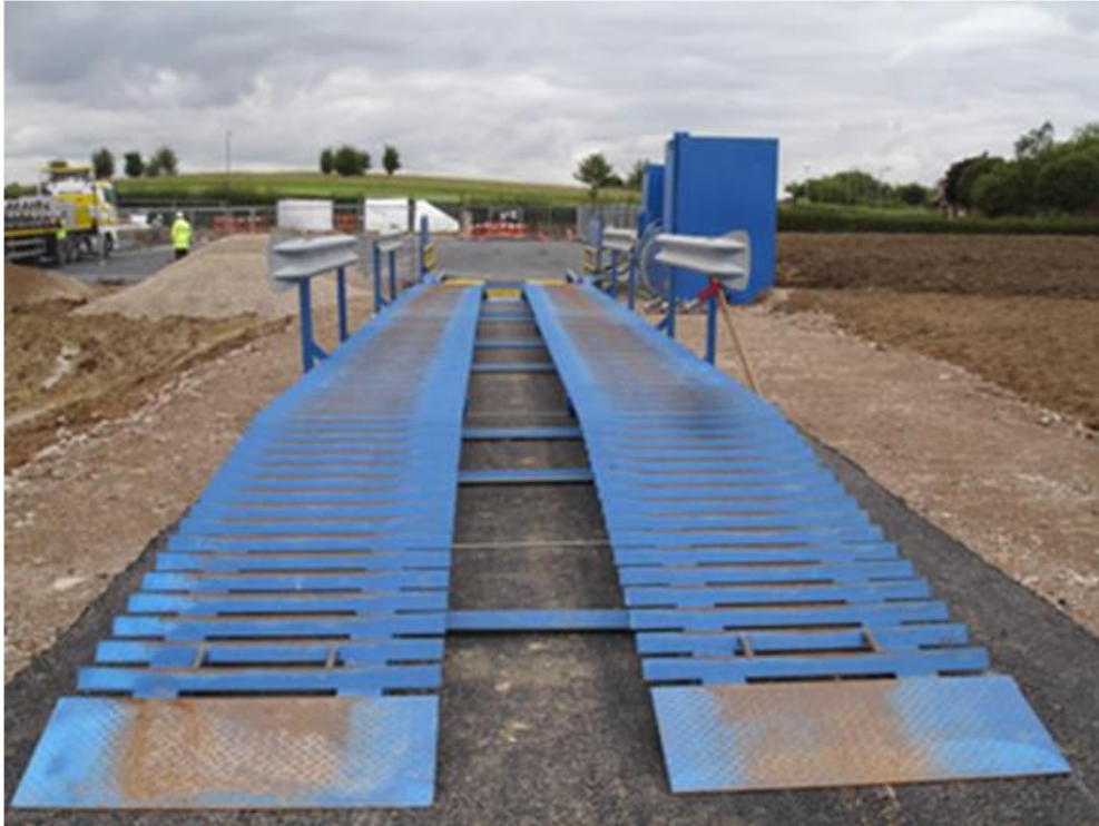
Plate 11: Example of a dry ramp wheel wash facility