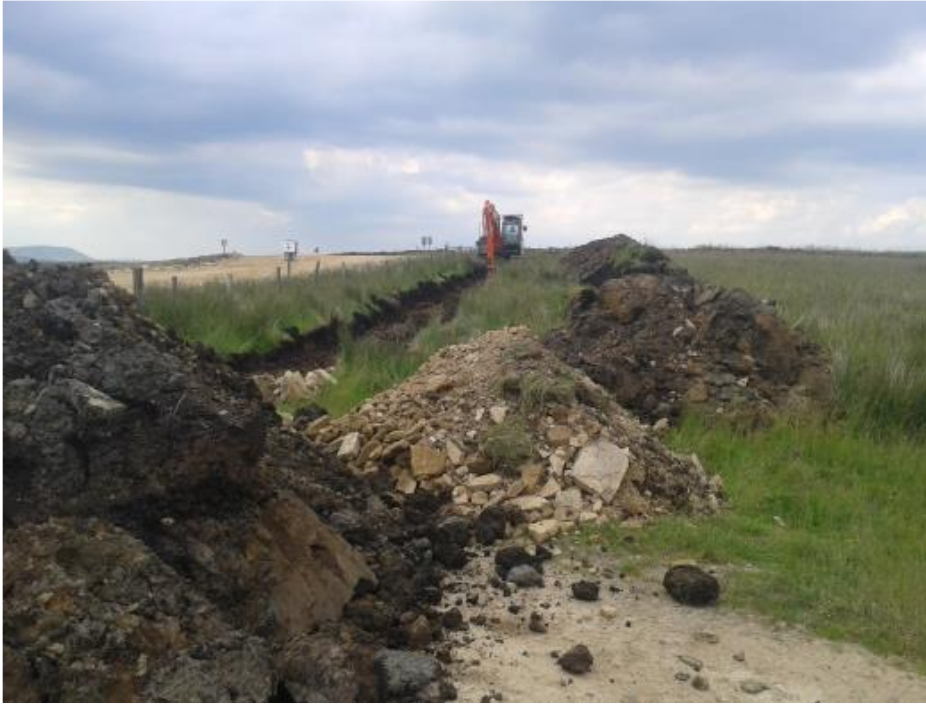
Plate 14: Typical overburden stockpile measures