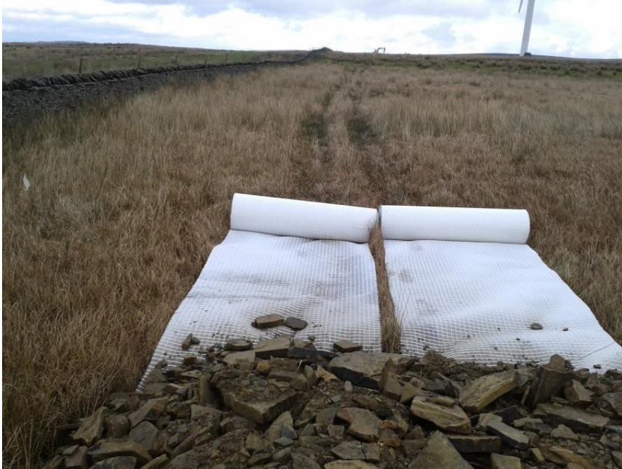
Plate 13: Semi-permeable geotextile layer