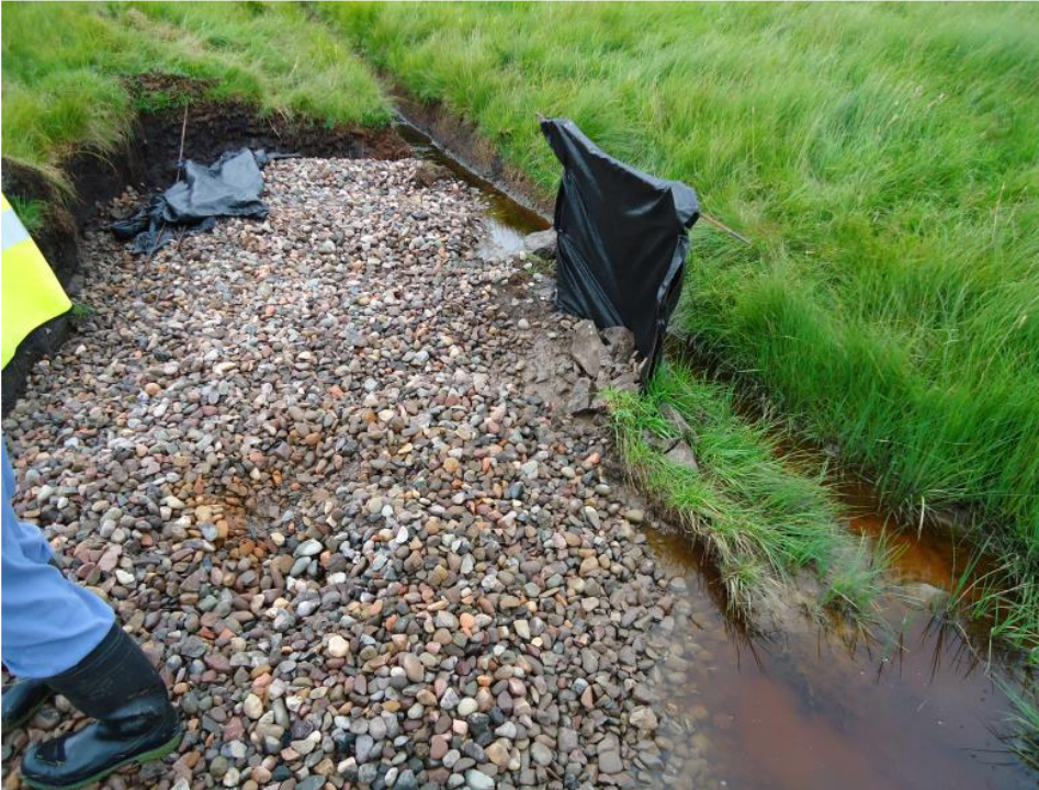
Plate 2: Typical silt traps