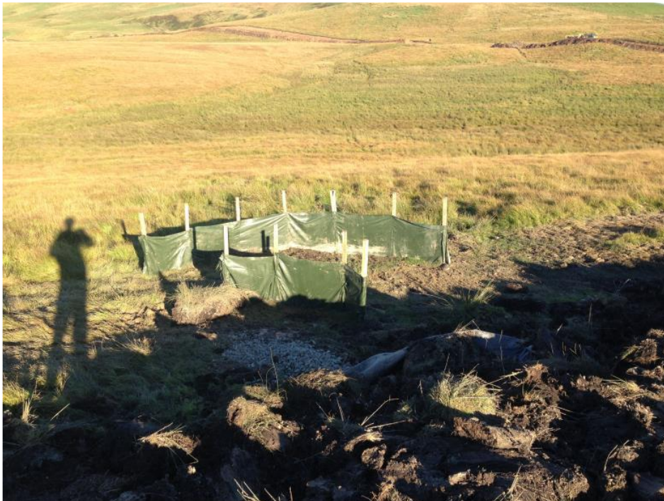
Plate 1: Typical silt fencing