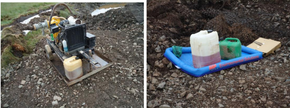
Plate 12: Examples of drip trays and bunds

2.4.28. Plate 12 displays examples of drip pans and bunds.